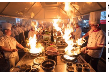
5500 future chefs learning to cook in tradition Chinese way

Pork is always on the menu in China and pigs were traditionally raised and slaughtered in backyard plots. In 2001, farms with more than 50 pigs made up just a guarter of the market. By 2015, an estimate three guarters of China's pigs were being raised on such farms'. The expanding appetite for poultry and eggs have also been industrialised.