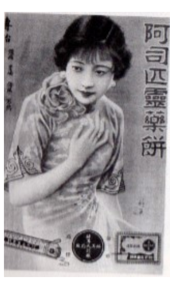
Aspirin advertisement In the 1930's