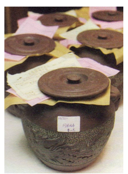
Vessels used to decoct herbs