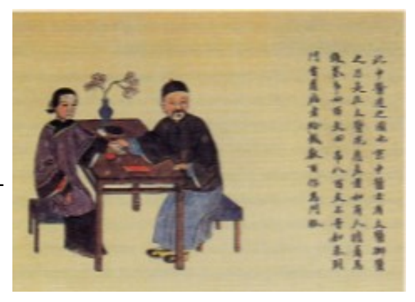
TCM doctor in Qing dynasty diagnosing patient

In ancient Chinese civilisation, astronomy, mathematics, agriculture and medicine were the four advanced sciences. They were the four complete systems of knowledge and skills developed in ancient China. Among them, medicine is the only one that has never been replaced by Western sciences and it still plays an important role in protecting the health of the Chinese. How does traditional Chinese medicine, a classic system of medicine without any connection with modern sciences can still exist in today's modern world? This is a question that has frequently been asked.