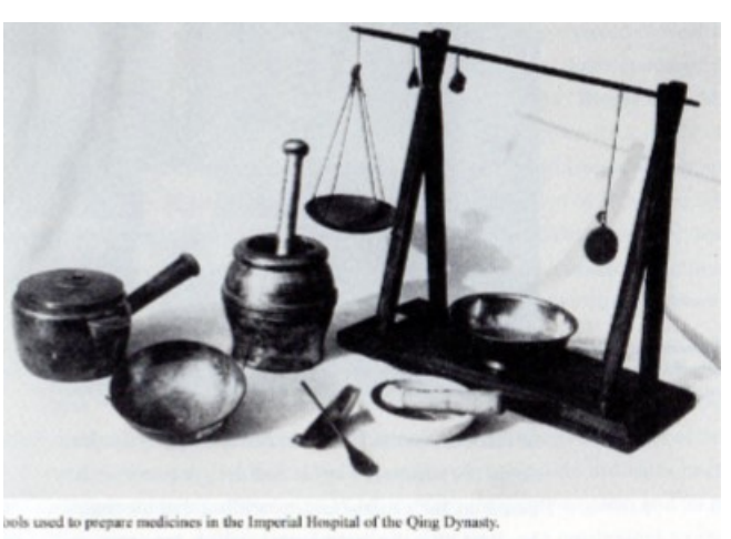
Tools used in Qing dynasty

developing traditional Chinese drugs. All these changes seem to have promoted the development of TCM. The compilation of textbooks on TCM in 1958 by several colleges of TCM, under the supervision of the Health Ministry had epoch making significance. This led to the re--establishment of the traditional ideas of the basic foundation of TCM by differentiating the false from the truth. And textbooks have been re-compiled and revised several times.