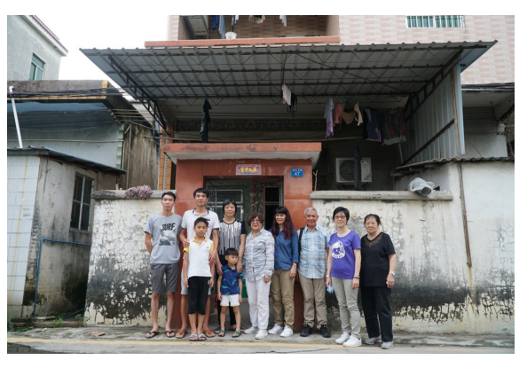
Outside relatives house in Bak-soi 白水村