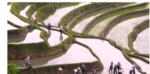
Planting seedlings in traditional rice terraces

The small fragmented nature of Chinese farms is the crucial difference from Western ones, and it's antithetical to the way much of the industrialized world produces food. If China is to meet its changing appetites with domestic crops, "there are a number of changes that we need," says Huang