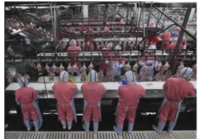
One of China's largest chicken processing factories employs 1500 workers and handles 10,000 birds per hour.

ing conundrum: how to feed nearly one-fifth of the world's population with less than one-tenth of its farmland, while adapting to changing tastes. Thirty years ago about a quarter of the country's people lived in cities, but by 2016, 57 per cent of the population was urban, living in a China that is wealthier and more technologically advanced, with a diet that increasingly resembles that of the West. The Chinese eat nearly three times as much meat as in 1990.