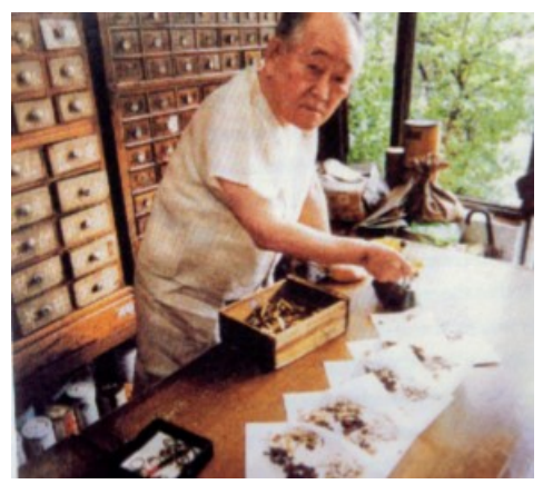
Older TCM doctors are more skilful and experienced