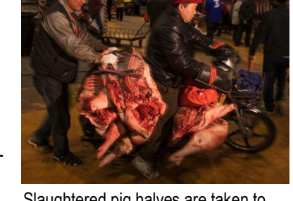
Slaughtered pig halves are taken to market on motor cycles

Recent scandals have pushed the authorities to modernize and the importance of food safety concerns. Melamine in milk formula, beans with banned pesticides, adulterated fox meat passed off as donkey meat are some of the concerns consumers now have.