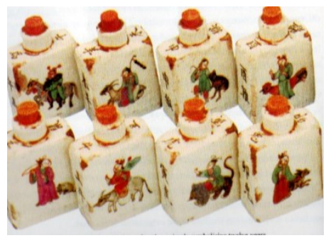
Porcelain bottles of medicine with paintings of the twelve Zodiac animals

In the 20th Century, there were two occurrences of epidemic encephalitis. Western medical doctors used the same therapeutic methods applied in the first time to deal with the second attack but there was no effect. TCM doctors advised the western doctors to change their methods and this proved effective. In the eyes of western doctors, the symptoms were the same therefore treatment would be the same but in the eyes of TCM doctors, the symptoms may be the same but the timing of the seasons and locality were not and this had to be taken into account.