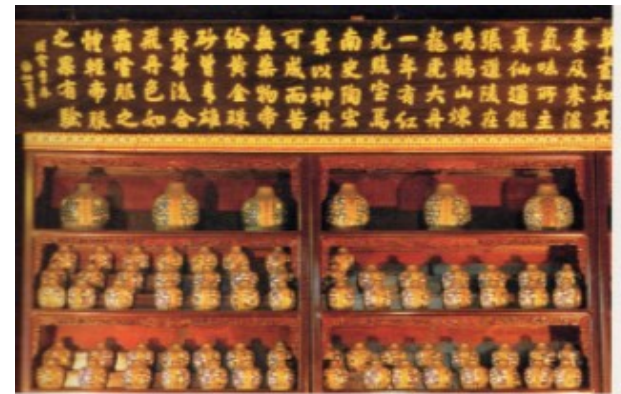
Traditional herbal medicine shop

Things have now changed with time and people are now studying TCM as a system of knowledge It was only when western medicine was introduced into China that the Chinese think about the differences between the two medicines. Under the pressure of western medicine, doctors of TCM actively took measures to defend, promote and invigorate TCM by setting up schools, training programmes, publishing literature and