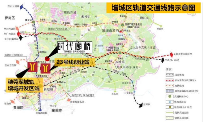
Rail Transportation System in Zengcheng District

The Chuangye Station of Metro Line 23 is right next to Times Bridges (Zengcheng). It only takes seven minutes by walk to arrive at the metro station, and within 30 minutes, you will be in Tianhe CBD in Guangzhou by the metro. Bus stops will also be set up in front of the project. The bus routes will be discussed by the Guangzhou Municipal Commission of Transportation.