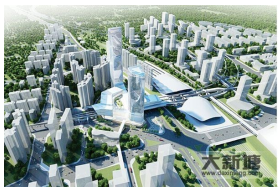
Times Bridges (Zengcheng): The New Eastern City Centre

"Southward Expansion, Northward Optimization, Eastward Advancement and Westward Connection" has been the core strategic principles of Guangzhou's urbanization. According to the urban planning in Guangzhou, Zengcheng Xintang will be developed into the new transportation hub in eastern Guangzhou, which will occupy an area seven times larger than that of the Guangzhou East Railway Station. The hub will integrate the national railway, intercity rail and urban metro lines and will accommodate a 260-meter high urban complex, which will be the first transportation-hub-based complex. Located at the favourable site in Zengcheng near the hub, Times Bridges (Zengcheng) will benefit from the development of this area and ensure a highly accessible life for the residents.