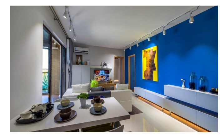
Sample apartment at Time Bridges in Zengcheng