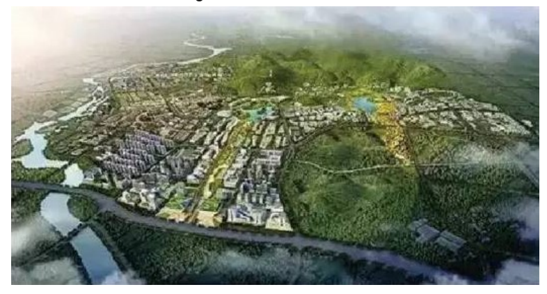
·Planning Map of the Area

The construction of the Guangzhou Higher Education Mega Centre will officially start from the end of 2015 with an estimated investment reaching 29 billion yuan. The Mega Centre will cover an area around 20 km² and another 10 km² for extension. There will be thirteen vocational schools settled in the first phase of the program with over 200,000 students and teachers moving into the area.