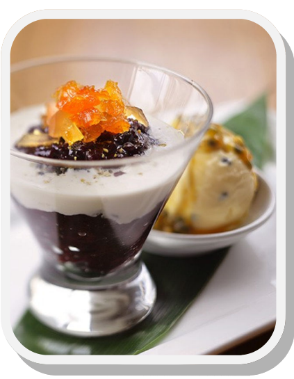
Black rice pudding