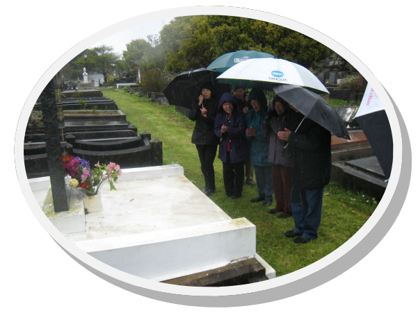
Those who braved the weather

attended enjoyed the yum cha lunch in the warmth of the Tung Jung rooms. In the evening, the Association had a public dinner at the Dragon's Restaurant in Tory Street. We had a full restaurant and all who attended were fully satisfied with the sumptuous meal the restaurant provided. The usual lucky draws are always popular and there were some excellent prizes for the raffles. In all, the evening was enjoyed by all.