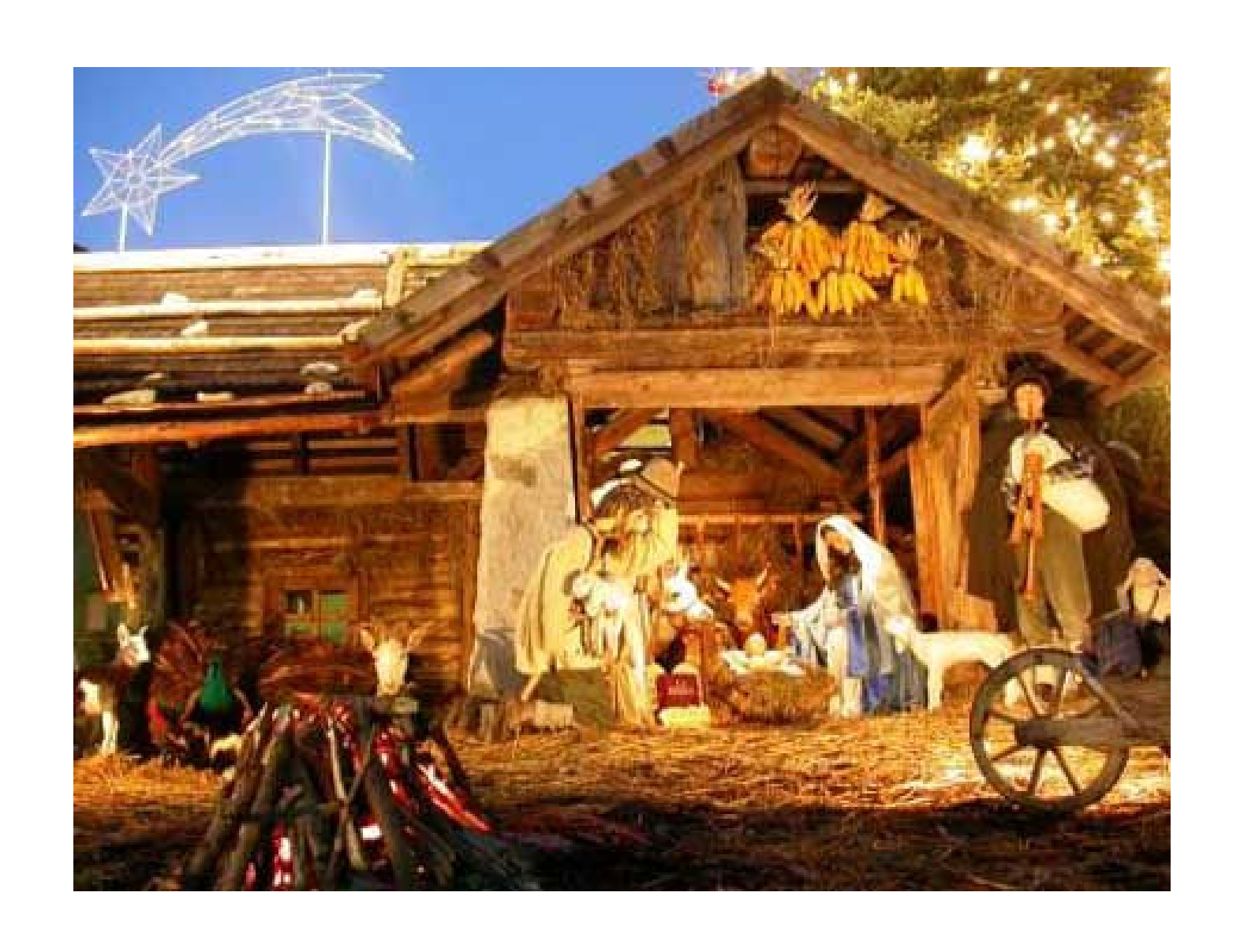
The president and committee of the Tung Jung Association would like to wish all its members and friends a very joyous Christmas and a bright and prosperous New Year