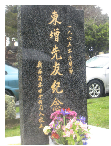
The Tung Jung Memorial

Normal procedure would be to sweep and clean the memorial, place fresh flowers and light incense sticks and place food on the memorial, offer it to the ancestors and then eat the food ourselves. Owing to the inclement weather that day, all that was not feasible so the fresh flowers were placed on the memorial, the ancestors honoured and then it was back to the Tung Jung rooms to eat the food and light the incense sticks. Those who