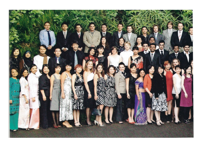
The changing face of doctors at Auckland School of Medicine. Left: Fourth year students in 1975 and (right) a representative number in the School's graduating class of 2009.