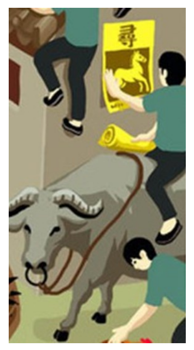
騎牛搵馬 [kèh ngáuh wán máh] (to ride an ox looking for a horse)

4. to score an easy goal after a shot has been blocked by the goal keeper.