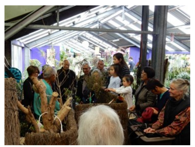
Interested members and friends